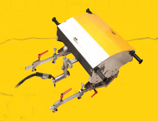
Model RW30110 Robotic Welder Shown

The Patented RW30 Robotic Welder is a computer controlled welder. It is ideal for repairing rails or frogs. The RW30 provides consistent high quality welds.