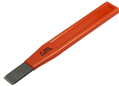
Scraping Blade 01800 IT/CST