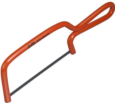
Junior Hacksaw 01810 IT/HSFJ