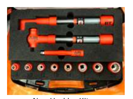
New Hockley Kit

WEB: www.austutilities.com.au PHONE: 08 9406 3200