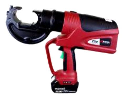
PAT750LI 12 TON Crimper