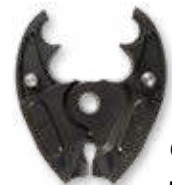
O & D3 Jaws