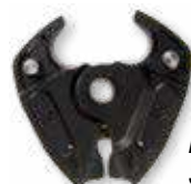
D3 Only Jaws Snub-nose