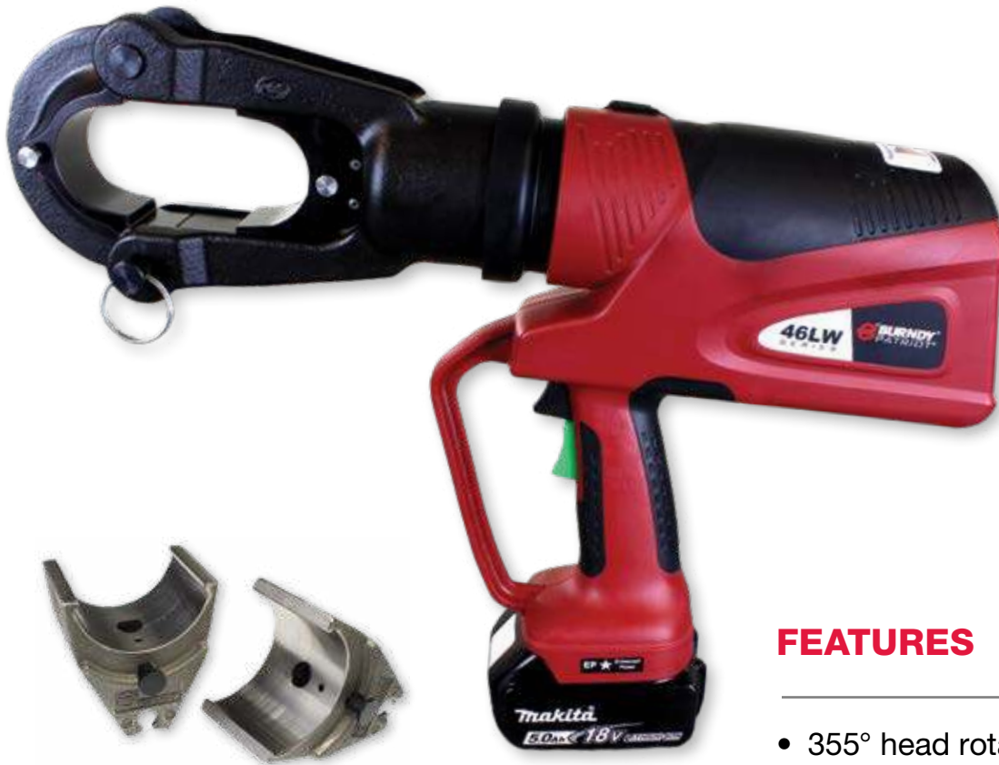
PUADP1 Die Adapter