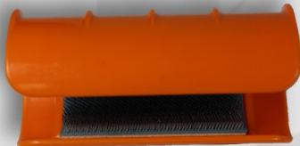
ORANGE FOR COPPER