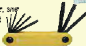
6292 SAE Hex Keys