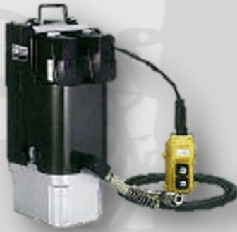
Battery Pump Unit