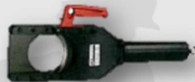
100mm AL/CU Cutter