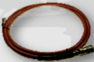
Non Conductive Hose