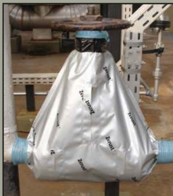
Coastal Terminal - Oil line with Gate Valve