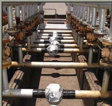
Inland Terminal - Oil Lines