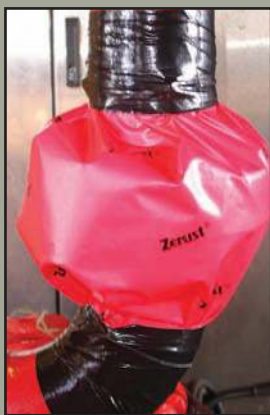
Offshore Platform - Fire Water Line